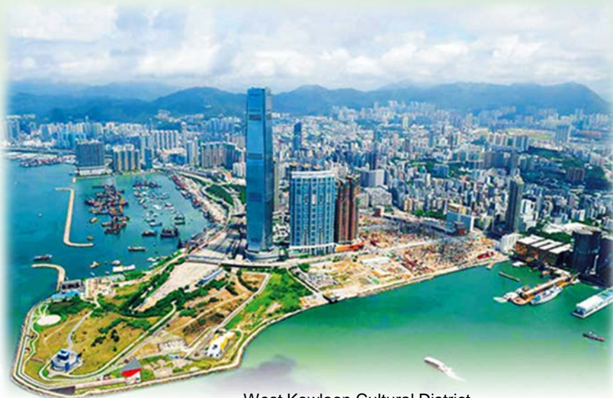
West Kowloon Cultural District