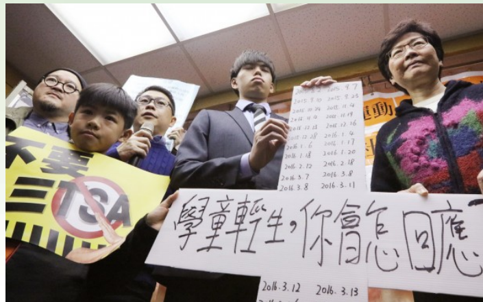
HK students need better mental health support in schools