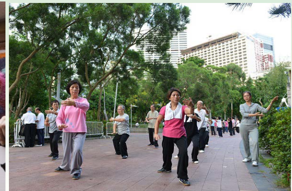
Tai Chi helps elderly to stay healthy